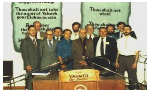
Speakers at Feast of Tabernacles' 1990s