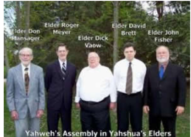
Yahweh's Assembly in Yahshua's Elders

There is no charge for our magazine or our literature as YAIY members and others want to share this scriptural and therefore spiritual truth with others through their tithes and offerings. To find out more about Yahweh's Assembly in Yahshua you can go to our web site, www.yaiy.org .]