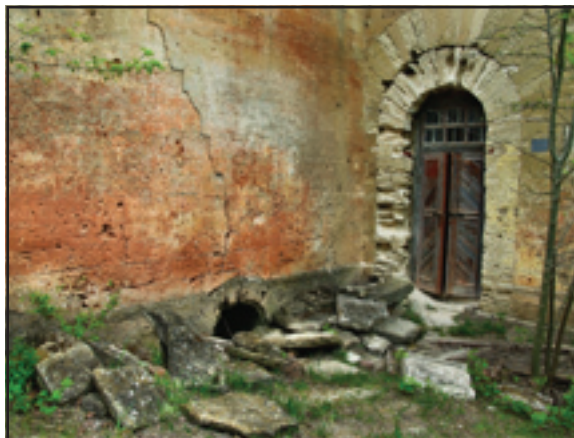
The path to the gate most likely will be full of obstacles causing hardships and pain