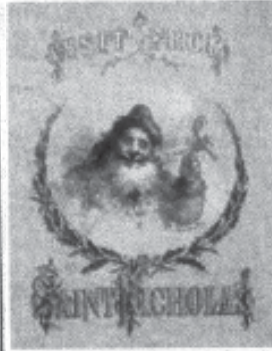
His looks are changing, but it is still Saint Nicholas Period Postcard