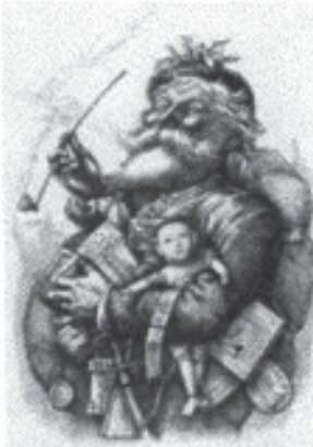
"Merry Old Santa Claus," by Thomas Nast, Harper's Weekly , January 1, 1881.