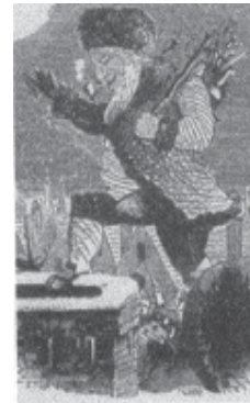
Saint Nicholas 1849 engraving by Boyd