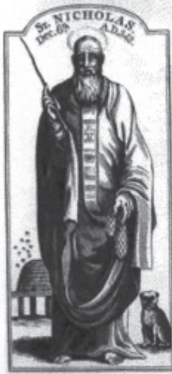
Detail from First Celebration of the Festival of St. Nicholas by The New-York Historical Society , Broadside by Alexander Anderson, December 6, 1810, commissioned by John Pintard, SY 1864-21, negative number 28883.