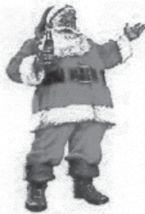
Coca-Cola Santa by Haddon Sundblom